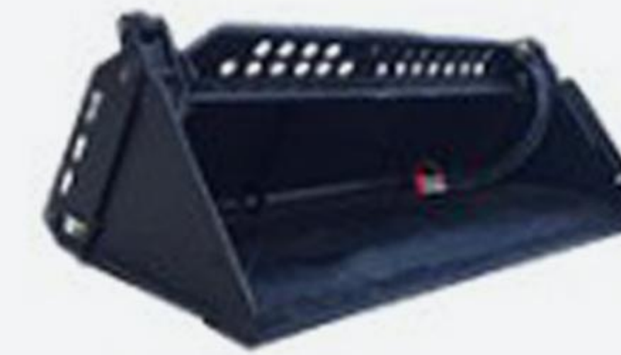
6 in 1 Bucket