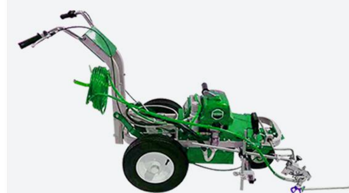
Cold Spray Marking