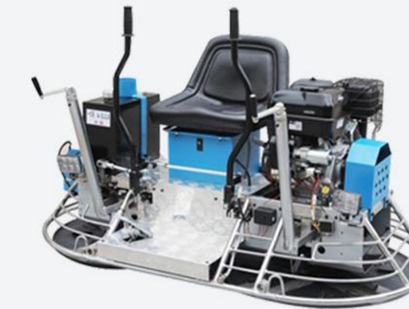
Ride Power Trowel