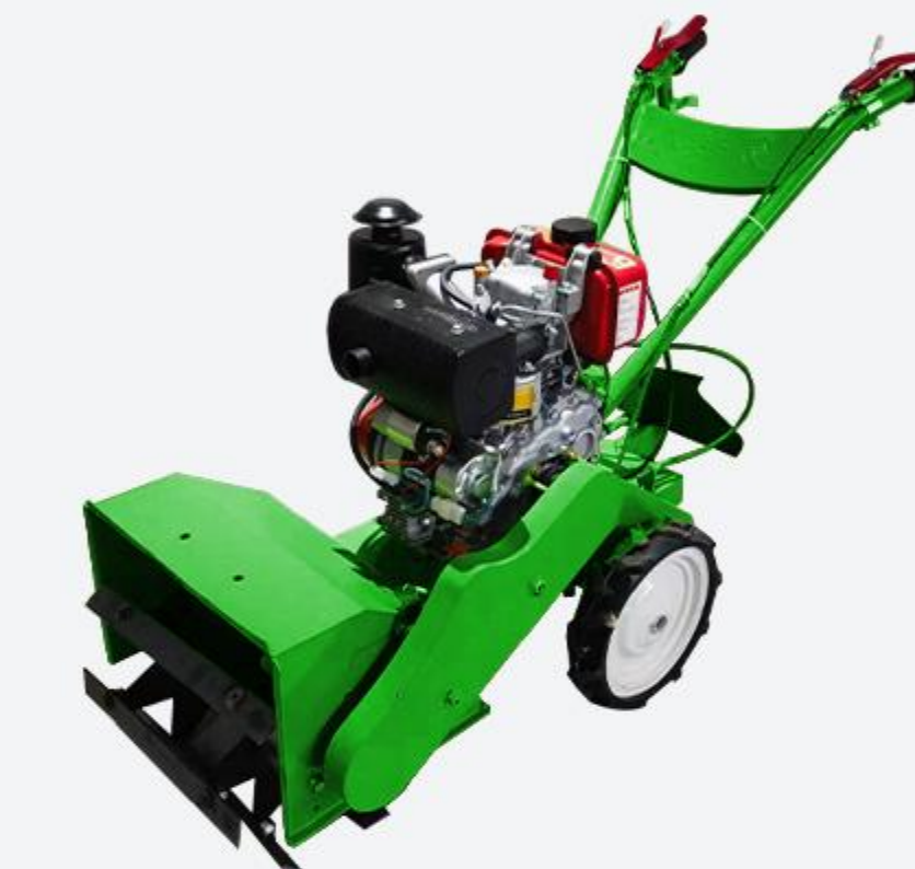
Mini Weeding Machine