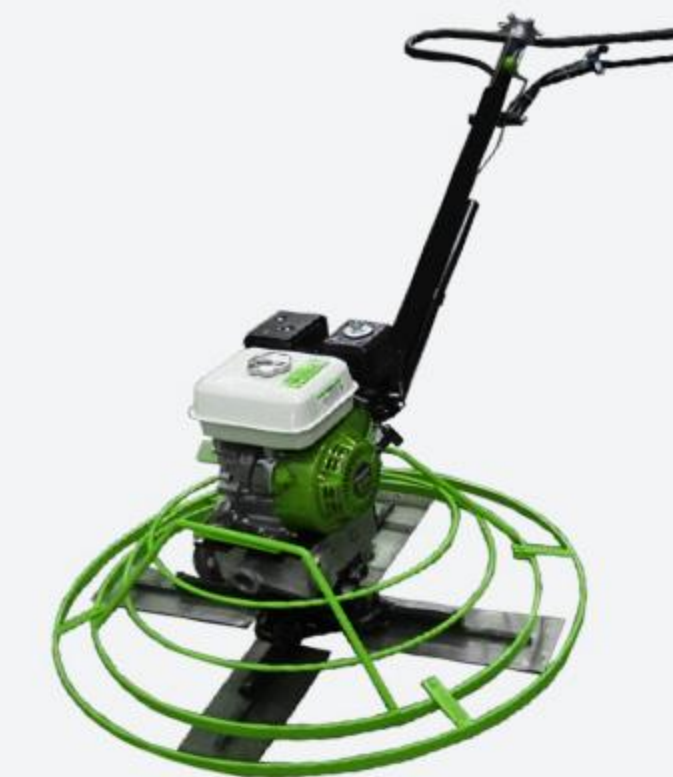
Hand Power Trowel