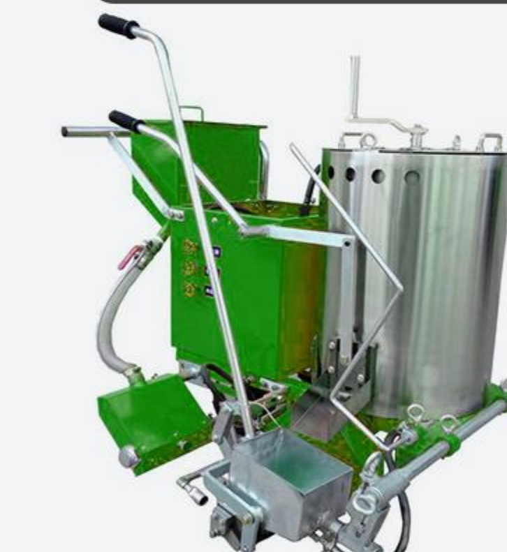
Hot Road Marking